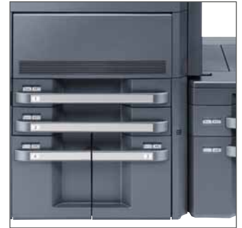
Max. paper tray capacity 7,650 cut sheets (7 trays + bypass)