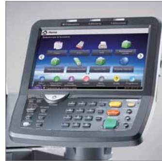
Tilttable operator panel, 10.1" touch screen

Technology for excellent communication. The broad 10.1" touch screen on this product line can be raised and tilted, for maximum flexibility in creating a personalised solution. The swipe functions , similar to those on a mobile device, make use of the display even easier. Accessibility is also guaranteed by the optional wireless network interface and on-the-move printing from smartphones and tablets .