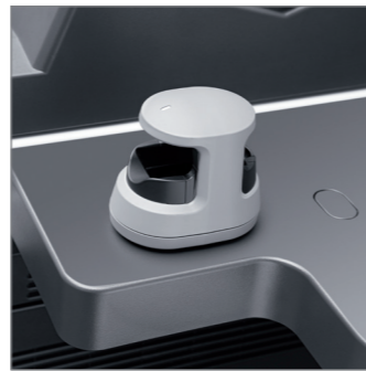
Advanced security options, multiple authentication systems