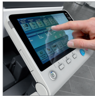
9" multi-touch display with 10-key pad (optional)

Integration with Active Directory or badge-based authentication ensure controlled access to printing and also provide the IT manager with important tools to monitor costs and cut paper and toner waste, for a more sustainable print environment. Secure use and respect for the environment, assisted by low TEC values.